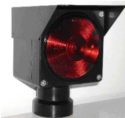
TT-FLASHER-BE with protective rain hood/shadow box for enhanced daylight visibility